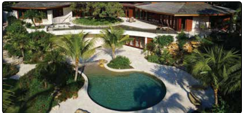
2014 Best of Show and Gold Award - Almar / Jackson Pools, Inc.