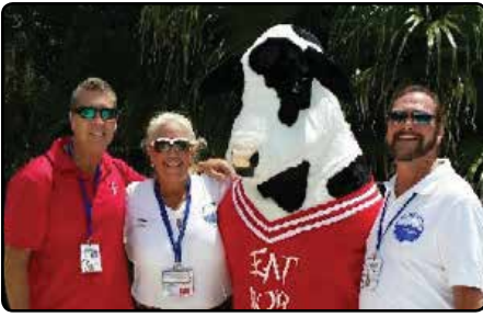
Central Florida Chapter Board members with the Chick-fil-A cow at the World's Largest Swimming Lesson on June 20. (Below) The Chapter also handed out safety materials.