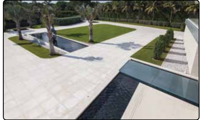
Gold Award - Almar/Jackson Pools, Inc.