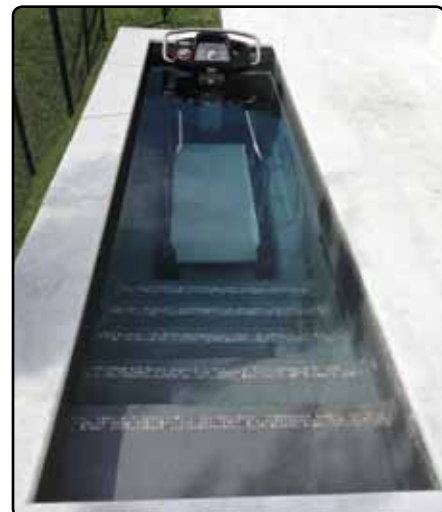
Technical Achievement Award - Signature Pools & Spas, Inc.