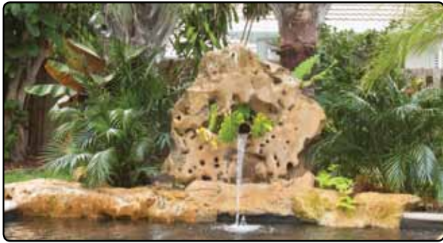
Silver Award - Lucas Lagoons, Inc.