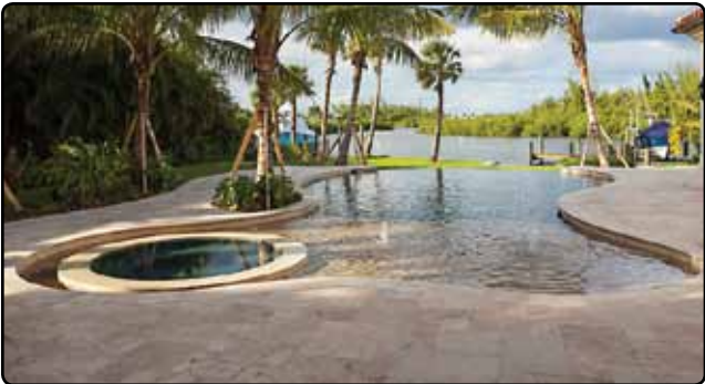
Award of Merit - AAA Custom Pools, Inc.