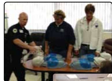
The Central Florida Chapter hosted a CPR certification in February. Twenty-five members took part.