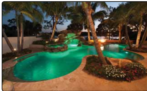
Silver Award - Brosseit's Pool Plumbing

See the rest of the Design Awards winners in the April issue of Florida Pool Pro sm !