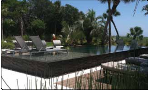
Gold Award - Cox Pools