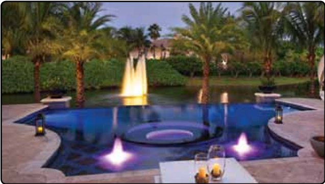
Silver Award - AAA Custom Pools, Inc.