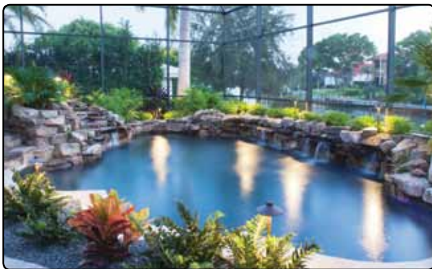
Bronze Award - Lucas Lagoons, Inc.