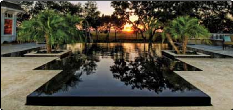
Best of Show and Gold Award - The Batts Company