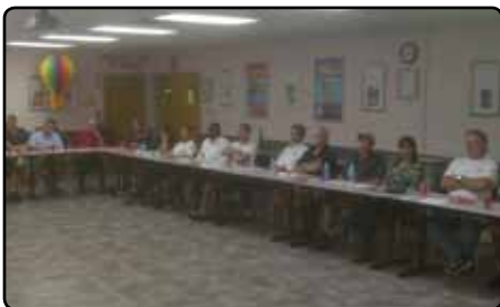
The Broward Chapter's meeting in January had a full house.