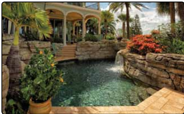
Gold Award - Riviera Pools